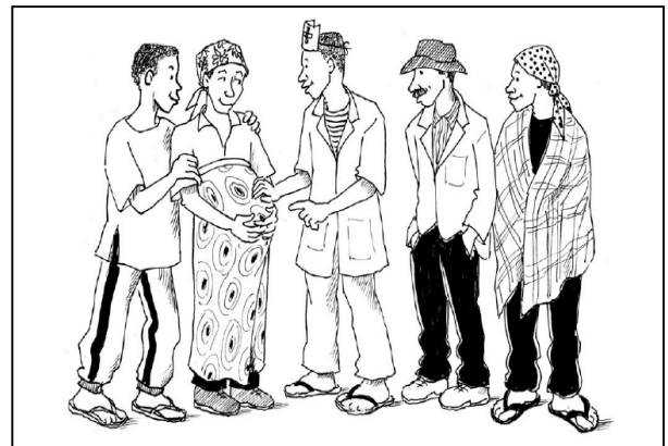
Young men role-playing support for young HIV-positive pregnant woman"

This can be deeply traumatic news at the best of times, but especially so if the women are treated judgmentally by health care staff, partners, other family members, neighbours, their religious groups and employers. Indeed there are reports from S. Africa of pregnant women, who may not even be HIV-positive, avoiding their local ante-natal clinic because they know they will be (wrongly) made to have an HIV test before receiving any care and they fear what they have seen of how other women are treated when their test result is positive. So this policy is actually undermining maternal and child health policies as well as HIV.